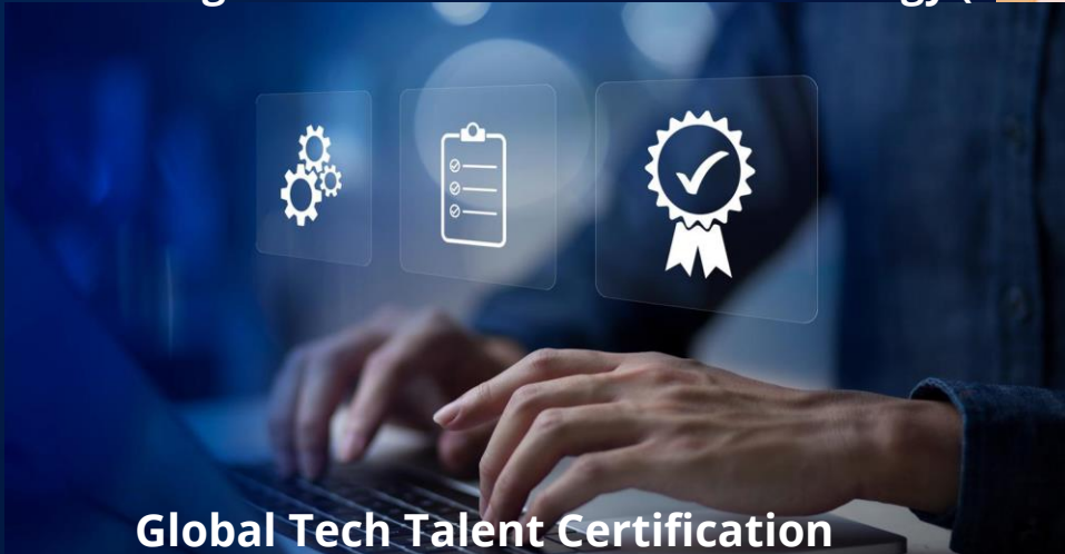
Global Tech Talent Certification