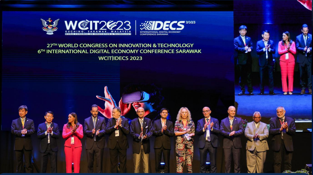
World Congress on Innovation and Technology (WCIT)