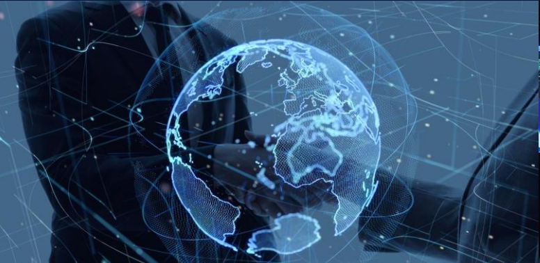
Global Partner Program