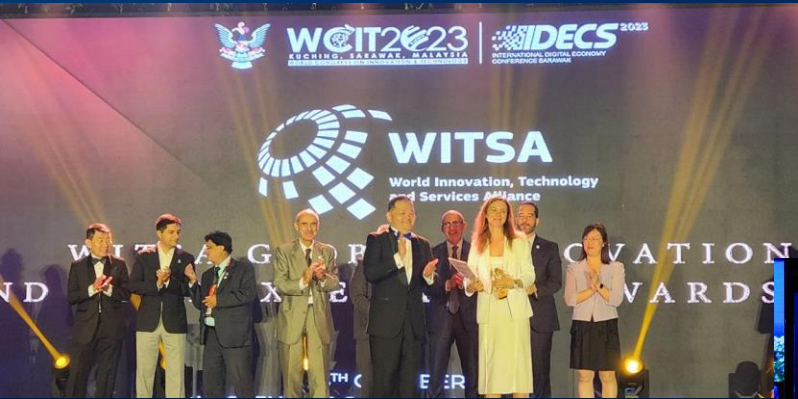
Global Innovation & Tech Excellence Awards