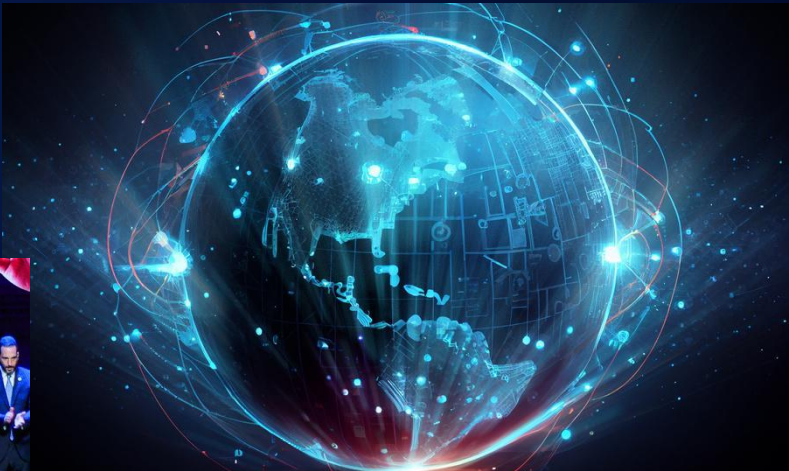
Global Tech Ecosystem Development